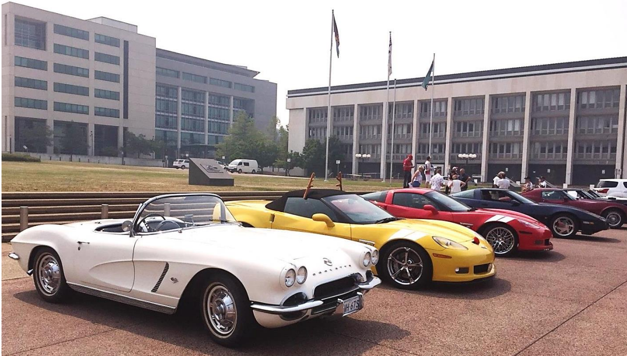
Studying or not-studying the Mystery Cruise instructions