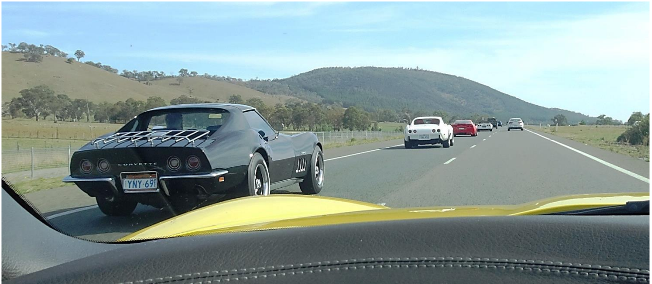
NSW Corvettes Club Vettes awaiting our arrival at the Robertson Pub