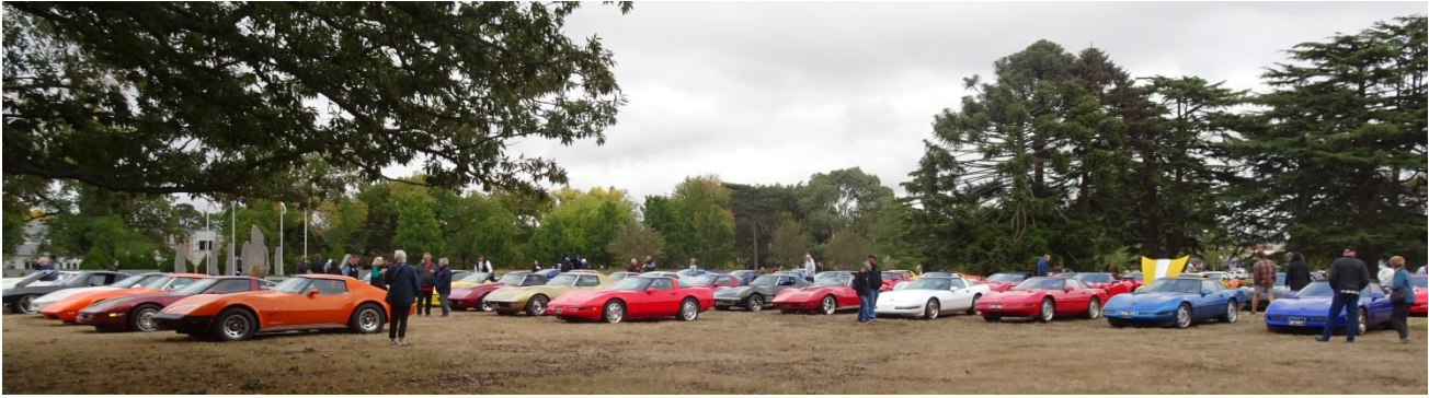
Great display of over 100 Vettes at the Show 'n' Shine-including eleven C8 models