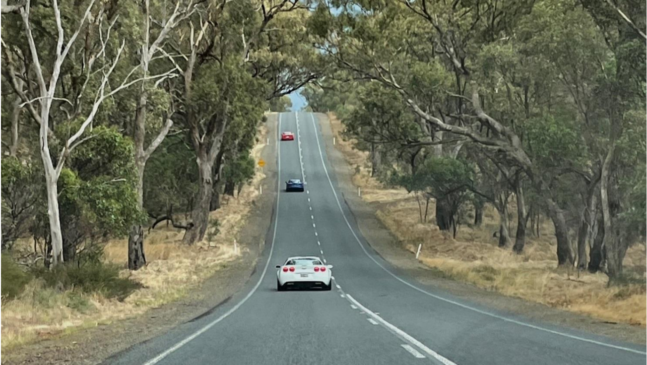
Morning tea break

It was an early start from Canberra for the 700km drive to Ballarat. Four Canberra Vettes joined by a C8, with members from the South Coast travelling a different route.