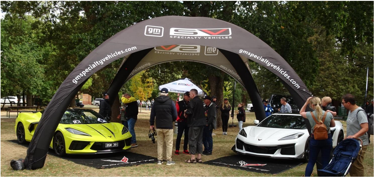
Many excellent Vettes from C1 to the latest C8 examples on show